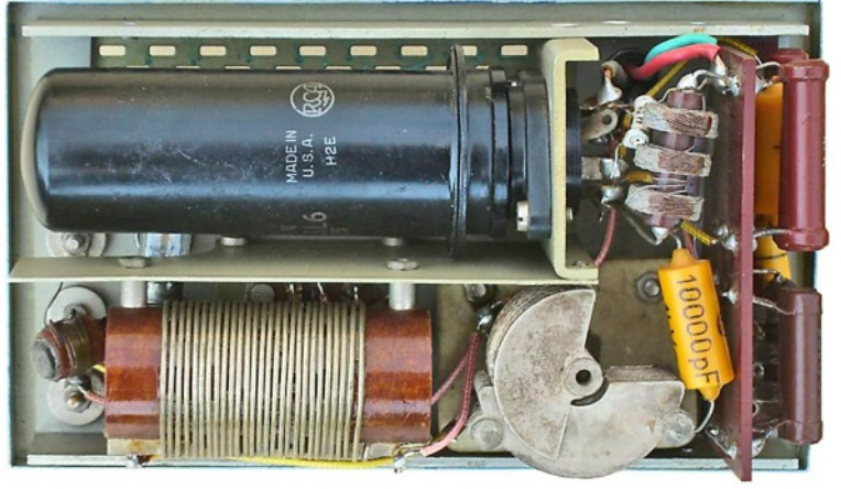
Internal view of the 'Plug-in' transmitter. Note the use of a metal version of the 6L6 valve.

© This WftW Volume 4 Amendment is a download from www.wftw.nl. It may be freely copied and distributed, but only in the current form.